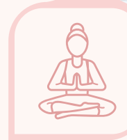
Members' Meeting Room