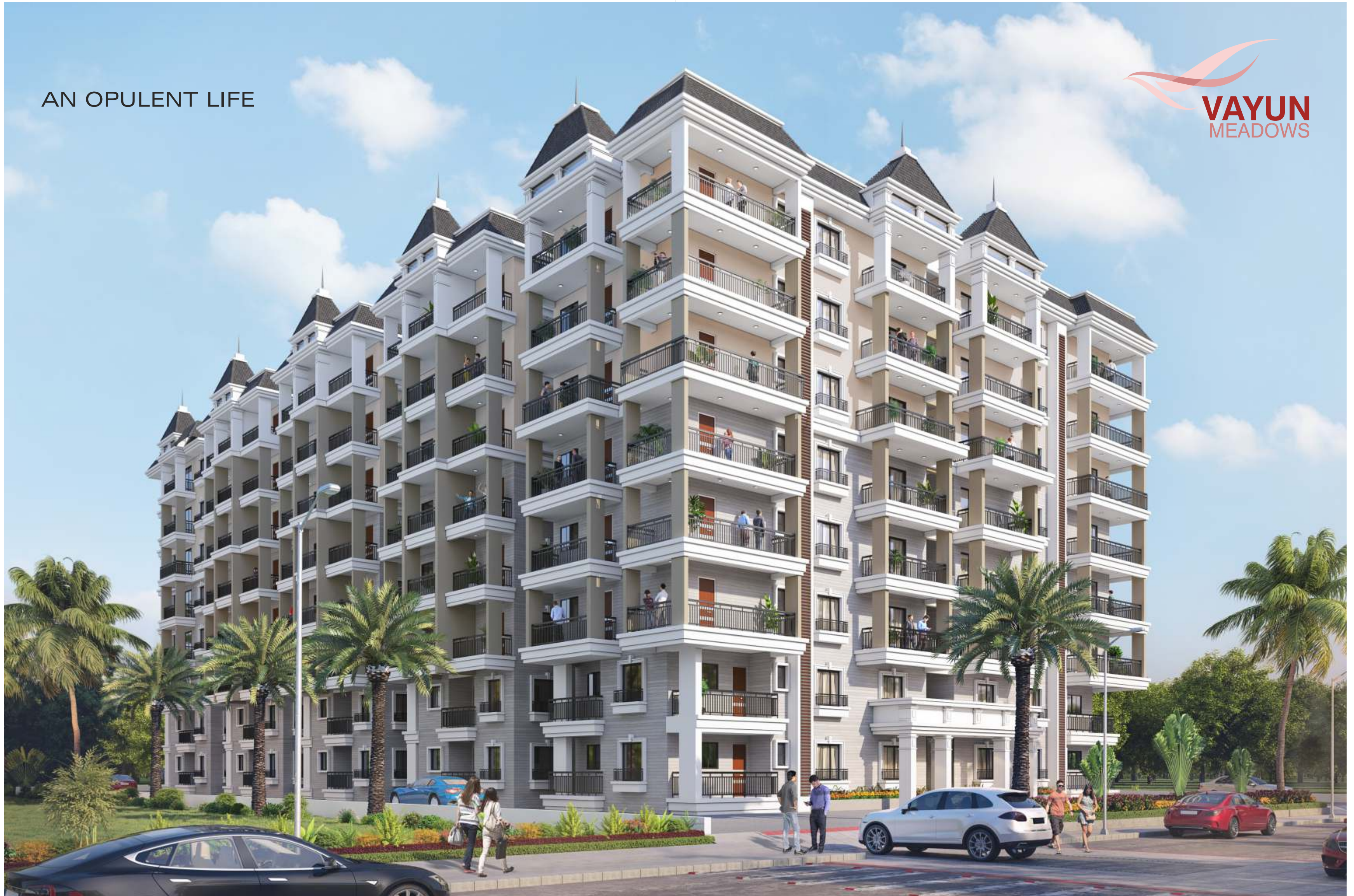
Vayun Meadows - Block C